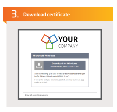
BYOD and guest users can easily onboard their devices for secure network access with intuitive self-service workflows—without IT intervention.

combination of cloud-based or virtualized on-premises deployment, built-in multi-tenancy, cost-effective per-user licensing, and superior ease of use.